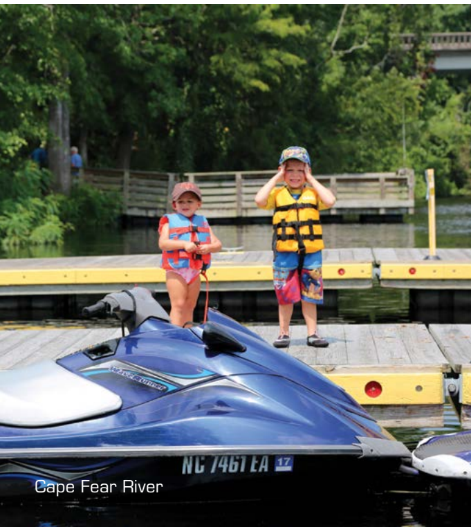
Cape Fear River