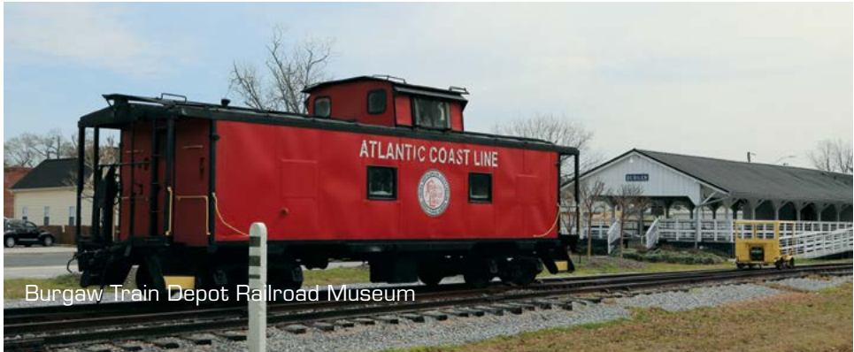
Burgaw Train Depot Railroad Museum