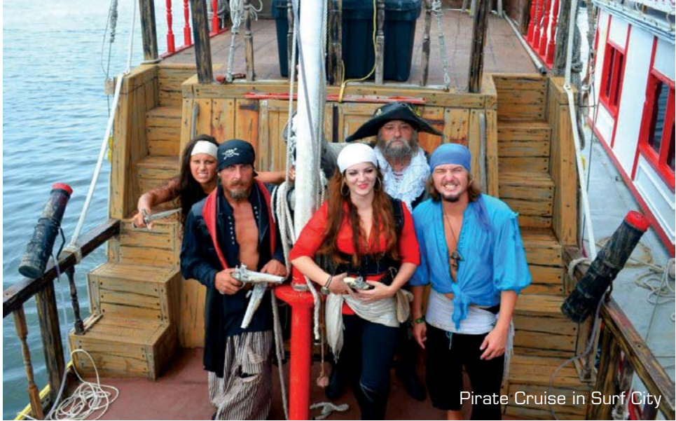
Pirate Cruise in Surf City